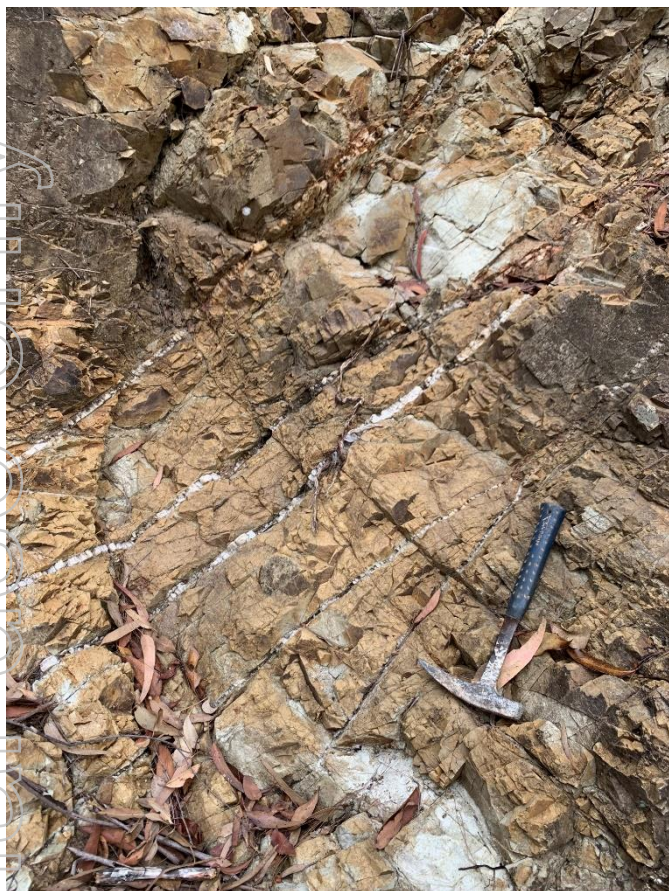
Sheeted quartz veins hosted within greywacke (Photo approx. 1m across)