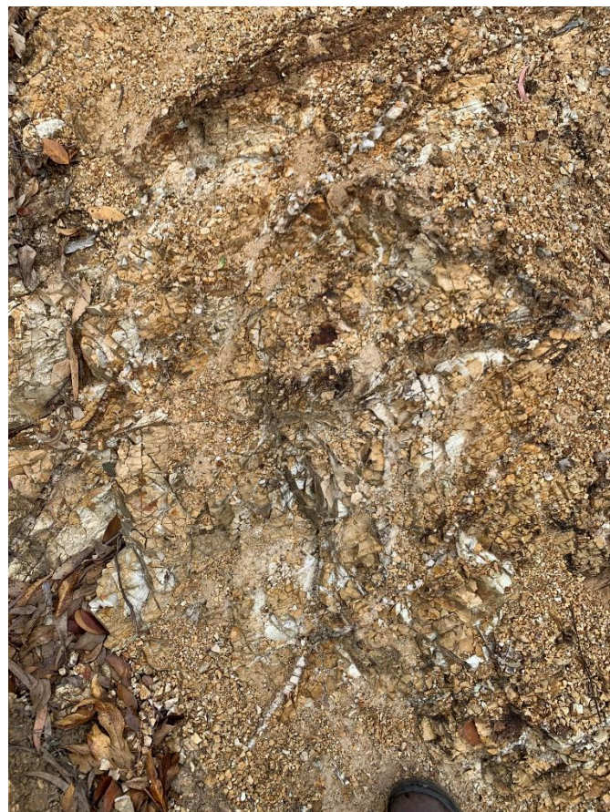
Stockwork quartz veins in weathered greywacke (Photo approx. 1m across)